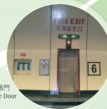
隧道分隔門 Cross-Passage Door