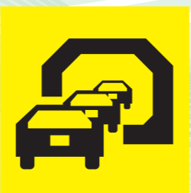
隧道交通擠塞 Tunnel Traffic Congestion