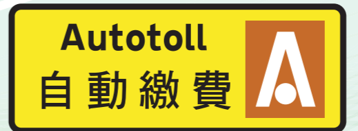
各隧道正逐步使用的自動繳費交通標誌 Traffic Signs for Autotoll being phased-in at various tunnels