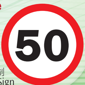
車速限制 Speed Limit Sign

Drive even more carefully when tunnels are under one-tube-two-way operation