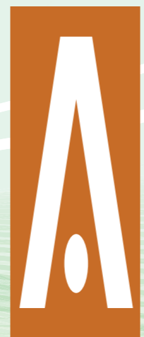
行車道上的自動 繳費道路標記 Road Marking showing on traffic lanes for Autotoll