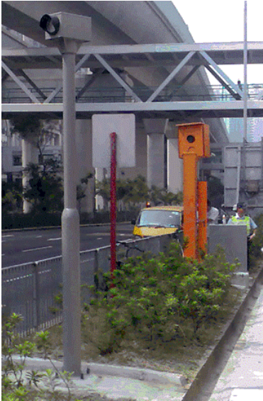
Camera (RLC1 / RLC2)