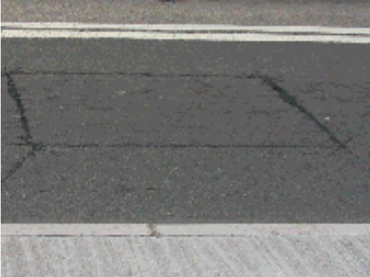
Close-up of Loop