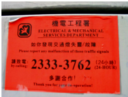
Notice on Roadside Cabinet