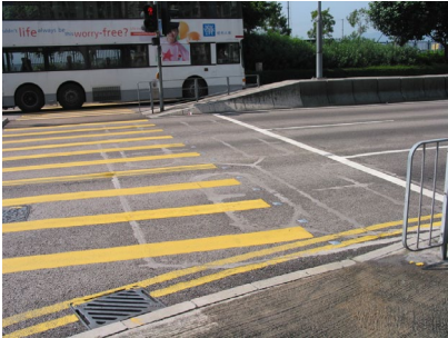
Loop at Junction