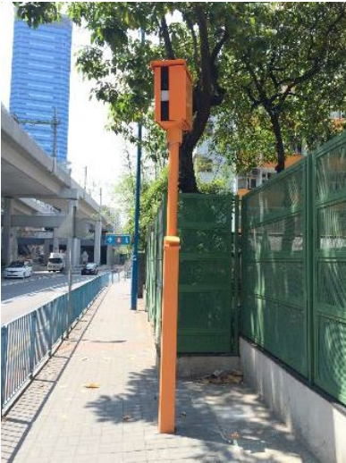
Camera (RLC4 - Type A) Standalone Camera Post