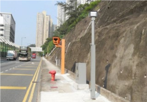
Camera with Radar, Flash Pole and Roadside Cabinet