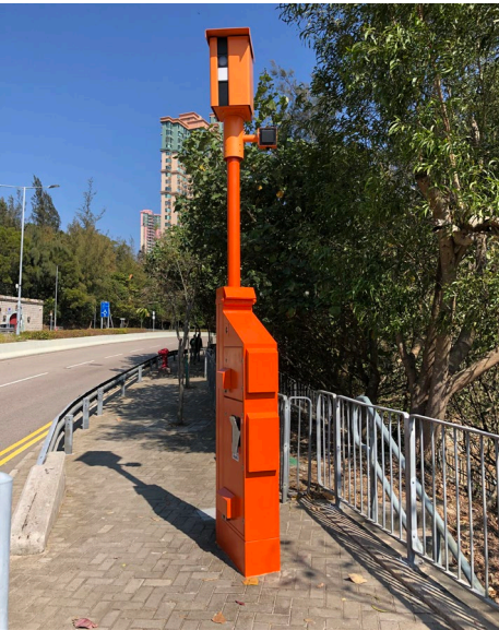
Camera and Radar