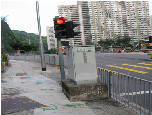
Traffic Light Post and Roadside Cabinet at Junction