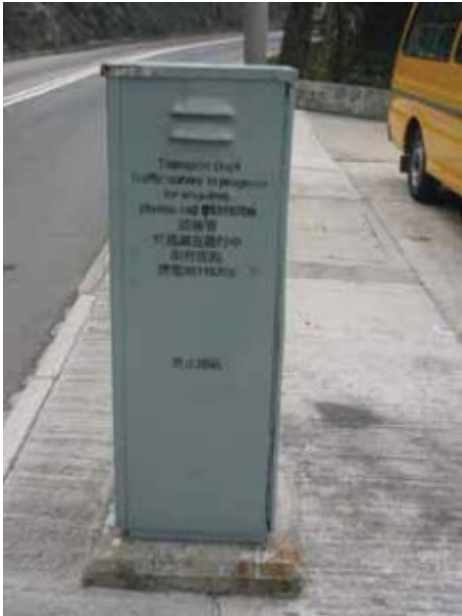
Close-up of Roadside Cabinet