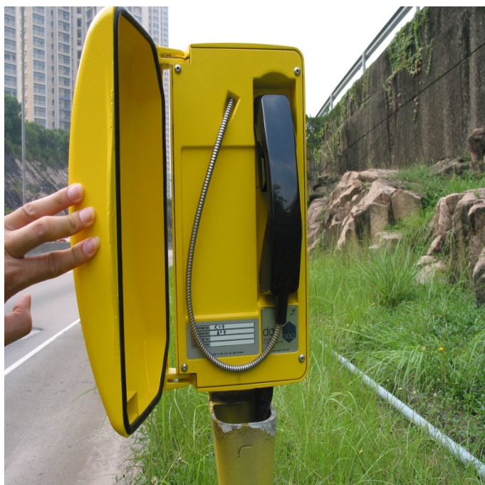
Close-up of Emergency Telephone