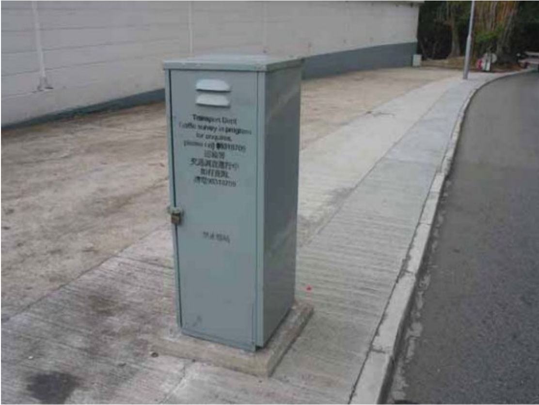
ATC Loop and Roadside Cabinet