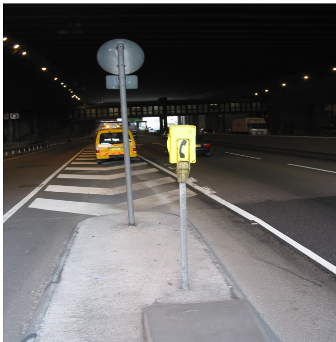
Telephone mounted on a post