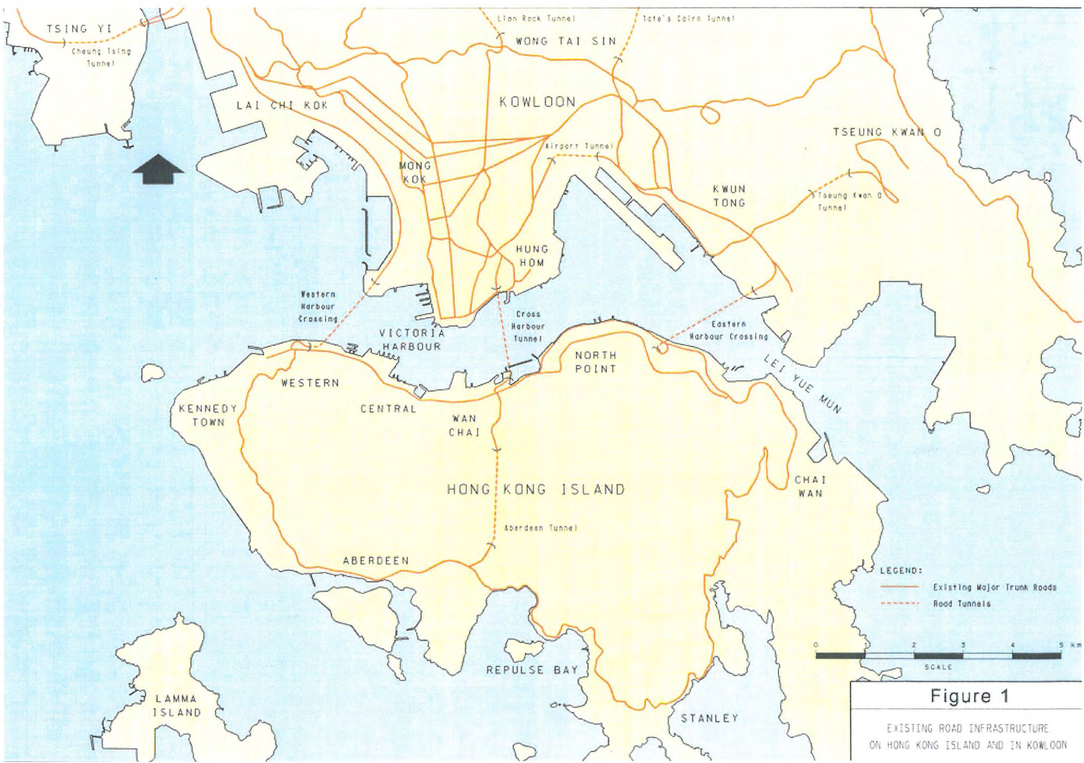
Figure 1 EXISTING ROAD INFRASTRUCTURE ON HONG KONG ISLAND AND IN KOWLOON