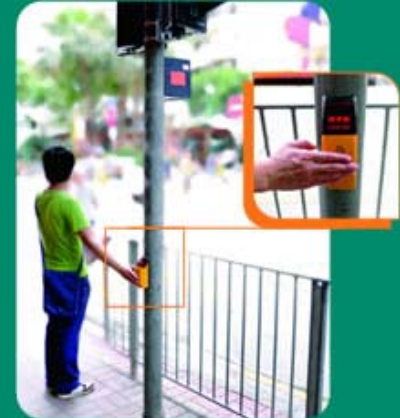
The pushbutton function is for the use of all pedestrians, not solely for VIPs