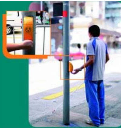
The tactile unit is solely for the use of VIPs