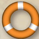
救生器具 ✓ Life-saving appliances